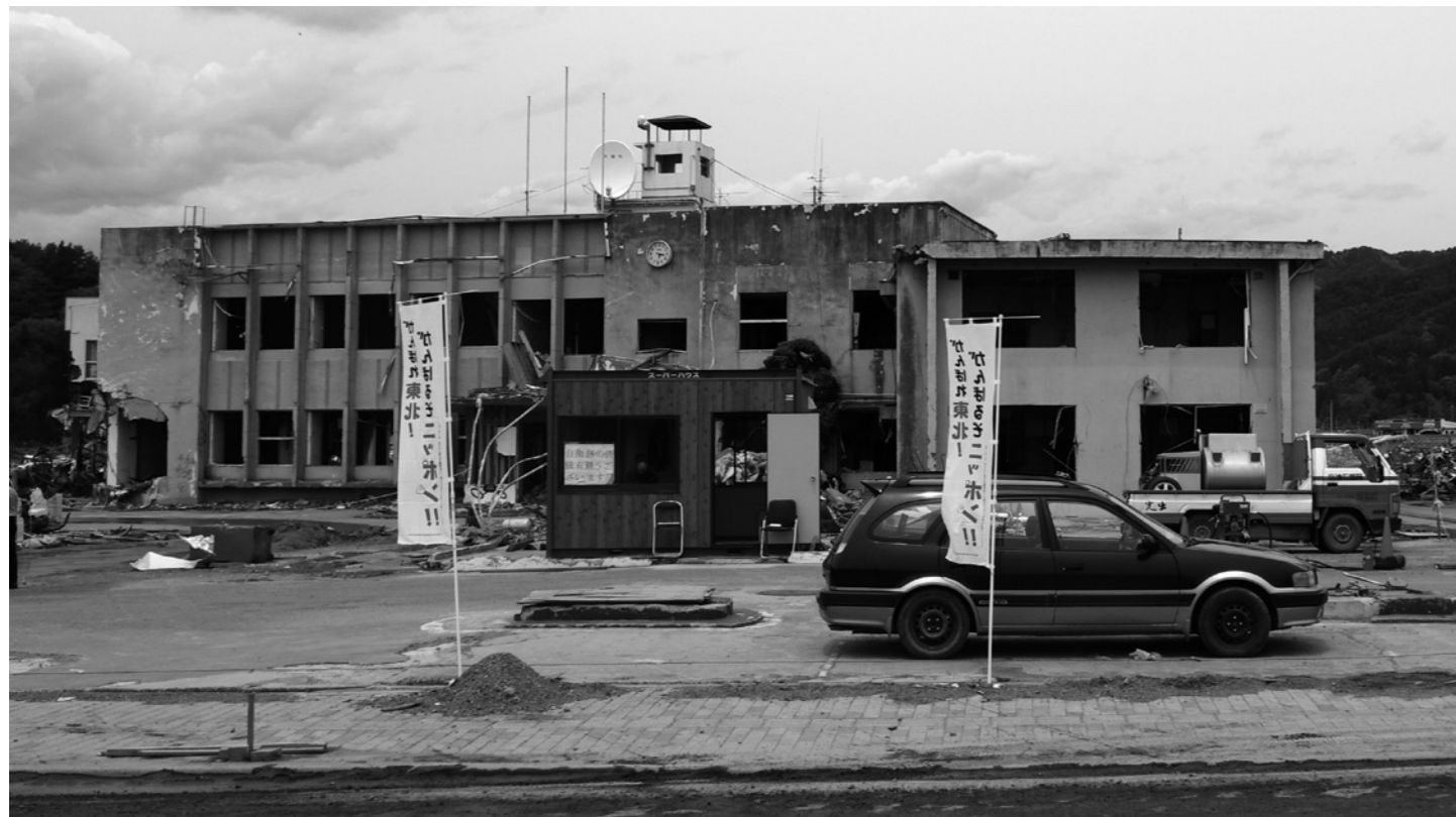
Site of the Otsuchi-cho town hall (Photographed May 23, 2011)