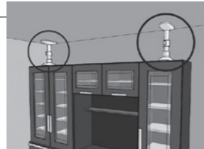
Strong earthquake strut