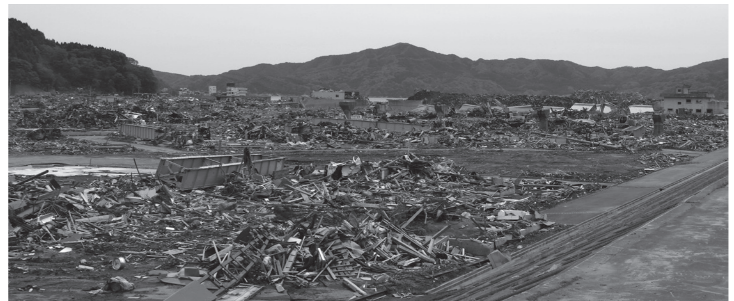
A destroyed town (Otsuchi-cho) (Photographed May 23, 2011)

Some of the contaminated water that collected in the reactors, including water contaminated by radioactive iodine, leaked into the ocean because the earthquake caused holes in the pipes.