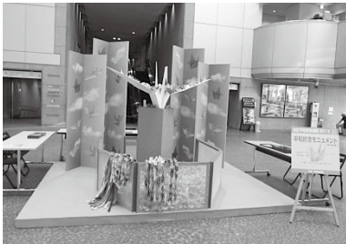
Prayer for Peace Monument from last year

We plan to host various events this year, too. Please check the July issues of Kita City News for the schedule.