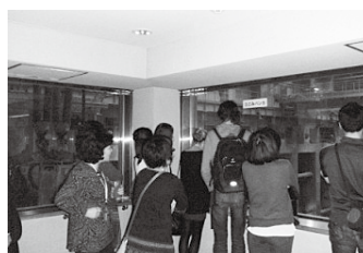
Kita Garbage Disposal Plant