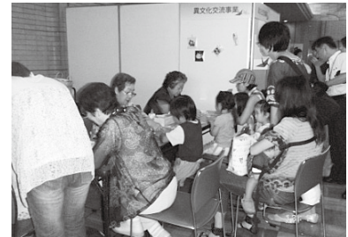
International exchange corner