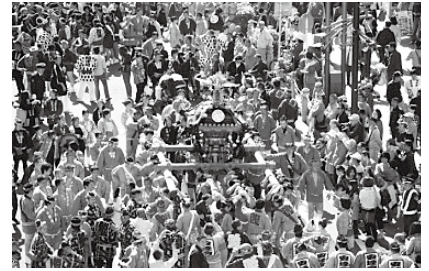
A portable shrine being carried at last year's festival

Every year in April, Kita City holds the Akabane “Baka” (Fools) Festival in Akabane. This is a major event hosted by local shopkeepers, who were inspired by the efforts of the feudal warlord Ota Dokan to spread singing and playing instrumental music among local people about five centuries ago. The festival got its named name because the first event was held on the April Fools Day.