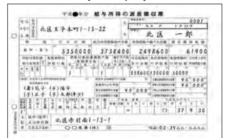
An example of a withholding slip issued by a company

Any of the above certificates can be used to certify your previous year's income as printed on the document. Please note that you must file for individual resident tax to get these certificates issued.