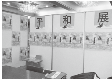
The Peace Exhibition at Akabane Hall