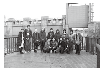
Arakawa Museum of Aqua