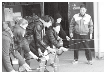
Disaster Prevention Center

Participant D: I was able to learn a lot by visiting the Arakawa Museum of Aqua. For example, Japan is blessed with many rivers, but also has a long history of fighting floods.