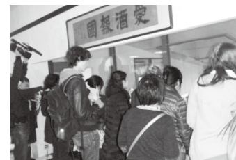
Koyama Shuzo Co., Ltd.